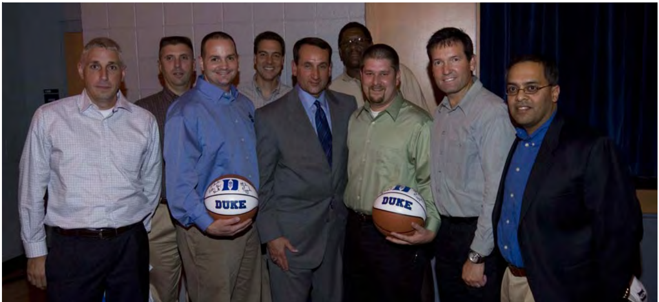
Participants from Alliance Partner General Mills with Coach Mike Krzyzewski at the Gala Dinner.

McKesson Corporation Maxcor Financial Group Merrill Lynch QAD, Inc. R.H. Donnelley Sankyo Pharma, Inc. Sun Life Financial Distributors, Inc. S&S Cycle, Inc. Vancouver Radiologists, P.C. Wachovia Corporation Wyeth